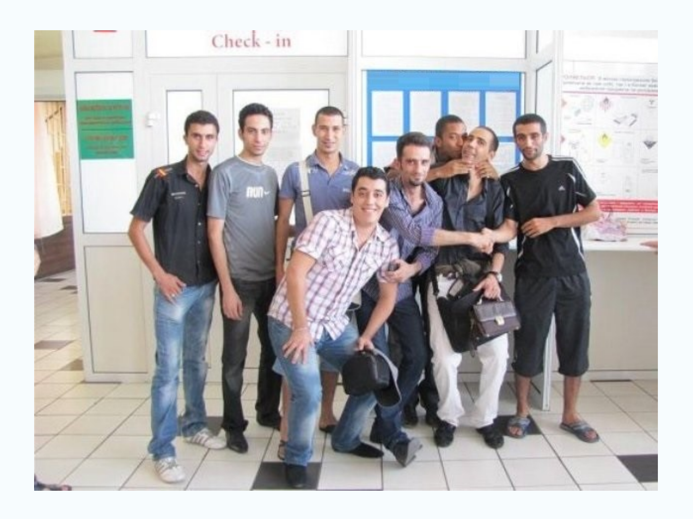
Donbas National Academy of Civil Engineering and Architecture invites foreign citizens to study